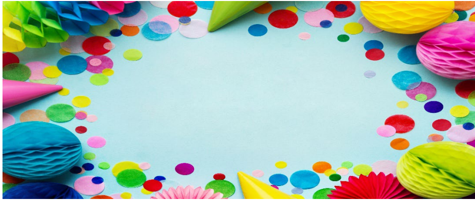
Table Decorating Contest

DIVISION 490 – TABLE DECORATING CONTEST – ADULT